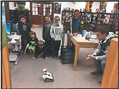
Robotics and computer programming come to life at the Bellwood-Antis Public Library with the programmable ReCon 6.0 Rover.

The Altoona District Libraries received a grant to buy toys and materials for a STEM “Maker Kit”. The 2016 District Maker Kit is freely available for all eight Blair County System Libraries to borrow for children’s programming. The kit features many different toys and materials to foster STEM education for children. The kit includes salt-powered robots, robotic rovers, microscopes, engineering/building toys for preschoolers, physics workshops, snap circuits, Little Bits Gadgets & Gizmos, various Hexbug playsets, and more. This project was made possible by a grant from the Institute of Museum & Library Services as administered by the Pennsylvania Department of Education through the Office of Commonwealth Libraries, and the Commonwealth of Pennsylvania, Tom Wolf, Governor.