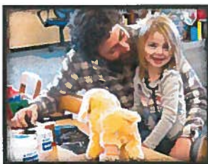
Amazing Animals Playscape at HAPL.

The new Play K program provides materials and a passive curriculum of activities for six different play and learn centers, or play-scapes. Each center is designed around an early childhood theme or topic to provide an interactive learning experience. Play K is aligned to Pennsylvania’s Learning Standards for Early Childhood with the goal of promoting early