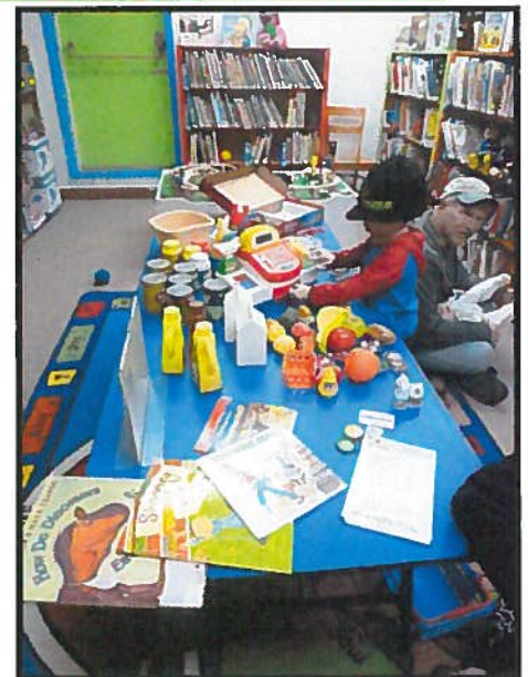
Above: A child at the Claysburg Area Public Library plays with the “Let’s Go Shopping” playscape, located in their easy reading section.