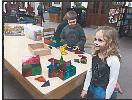
Also in Bellwood, the Amusement Park Engineer Maker Kit provides an engaging way to teach simple engineering concepts to kids.