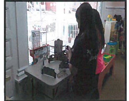
At the Roaring Spring Community Library, a child tests out the Hexbug Battle Spiders, remote-controlled battling robots.