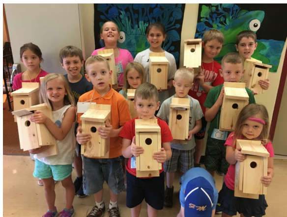
Bird boxes in Altoona