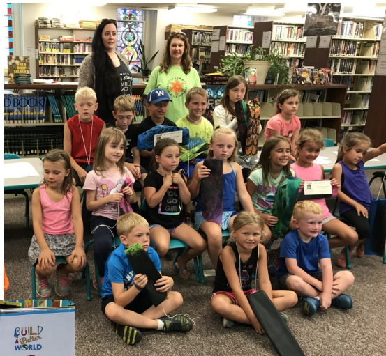
Koinobori in Williamsburg