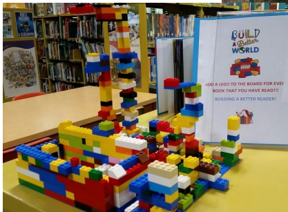
Legos in Martinsburg