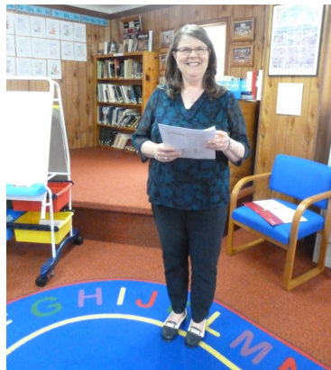
An investing educator at Claysburg Area Public Library

To play, participants visit a participating location, read the content on each poster, scan the unique QR code to access that topic's quiz question, and submit their answer via smartphone, tablet, laptop computer, or public computer available at the participating location.